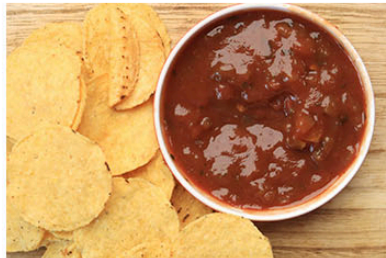
Ohh So Adobo Latin Seasoning